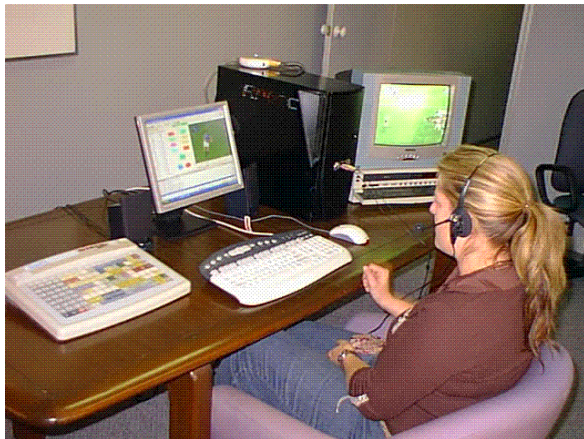
Log race data and digital vision easily, efficiently and accurately